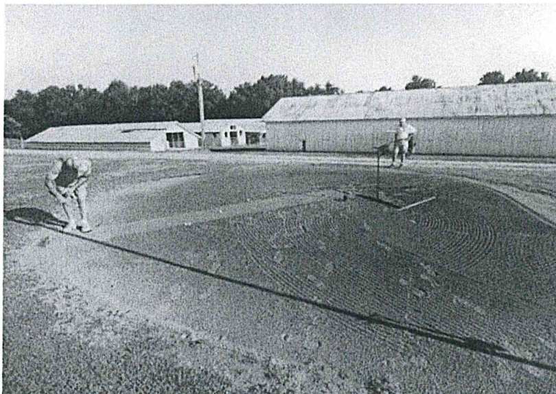
Picture of player putting on sand greens.